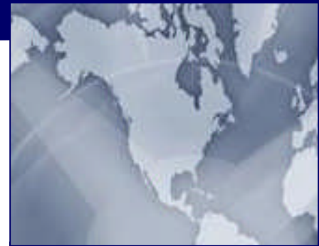
Growing Our Coverage Model

Says Kleeman, "Each Service Center is staffed with our own employees and comes equipped with a Hotspares™ lab environment that guarantees our customers receive the best service from the best engineers in the industry."